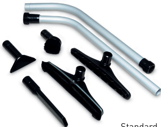
Standard tool kit includes adjustable telescopic wand, 3" dusting brush, crevice tool and more.